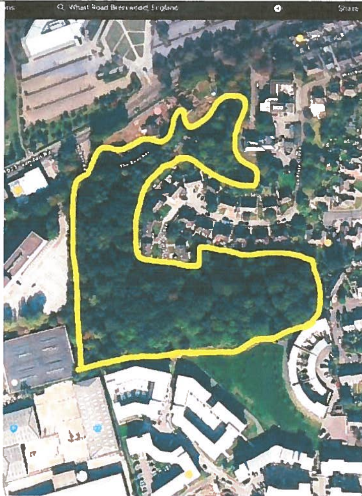
La Plata Wood (a rough indication is above).